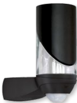
black with globe London