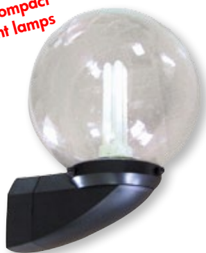
black with globe Oslo