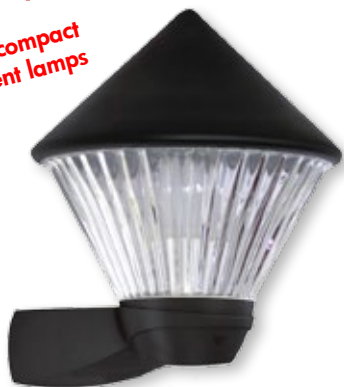
black with globe Frankfurt