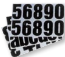
Set of numerals