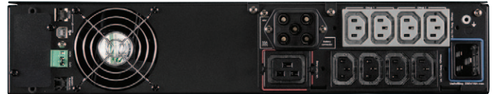
5PX from 1500VA to 3000VA.