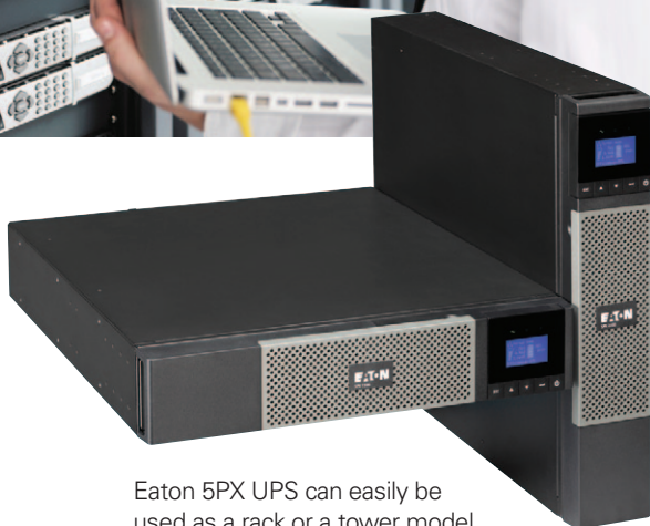
Eaton 5PX UPS can easily be used as a rack or a tower model.