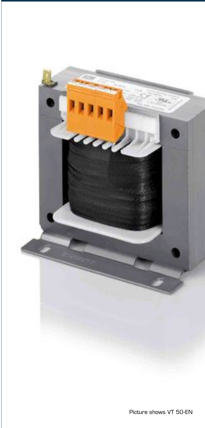
Picture shows VT 50-EN