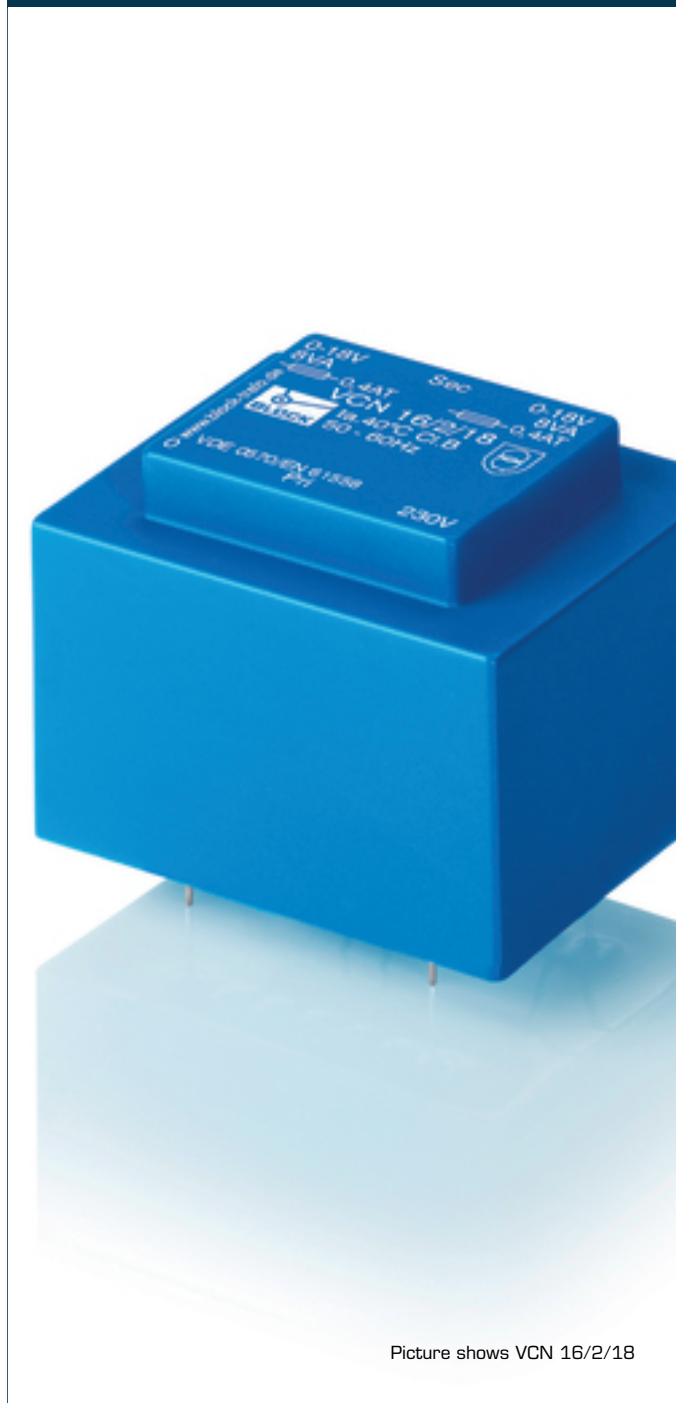
Picture shows VCN 16/2/18