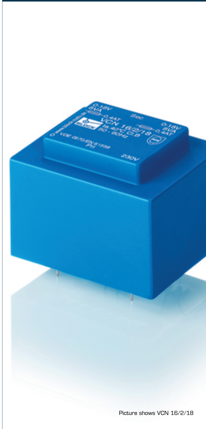
Picture shows VCN 16/2/18