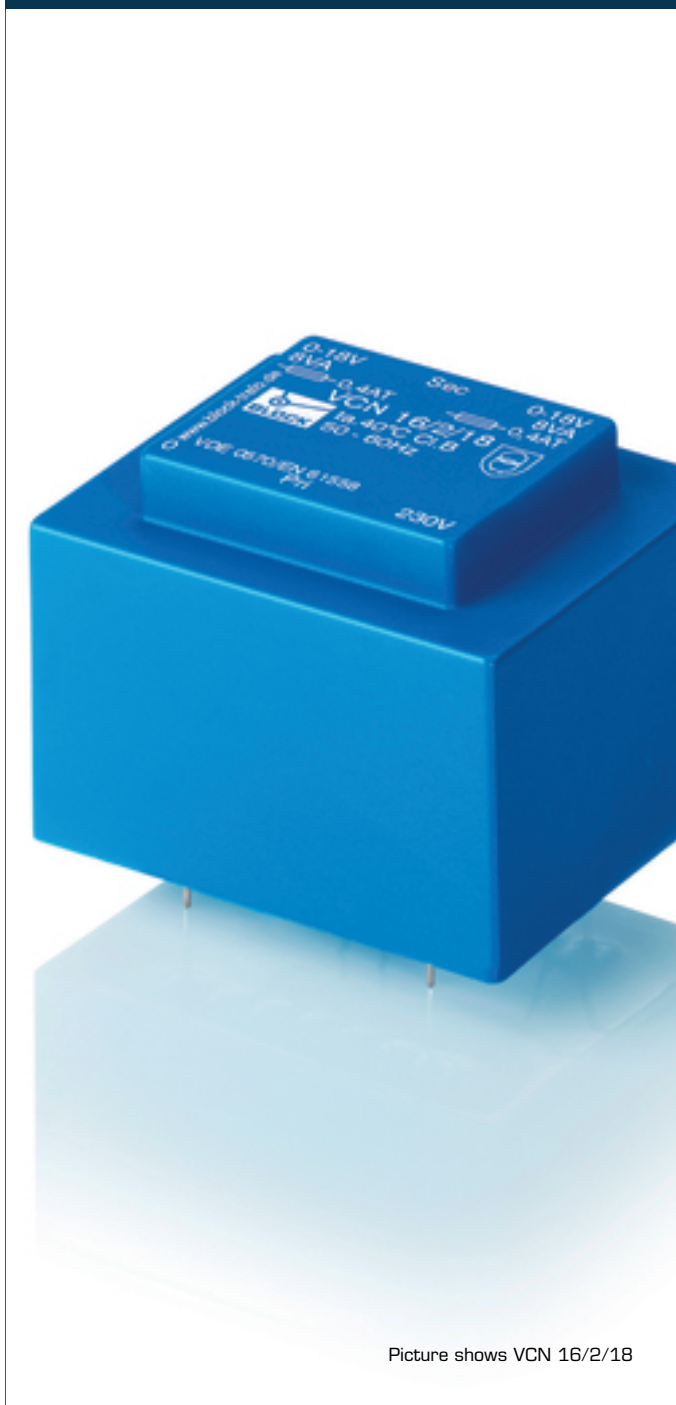
Picture shows VCN 16/2/18