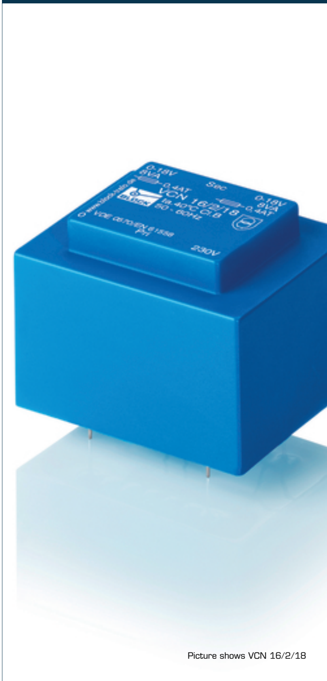
Picture shows VCN 16/2/18