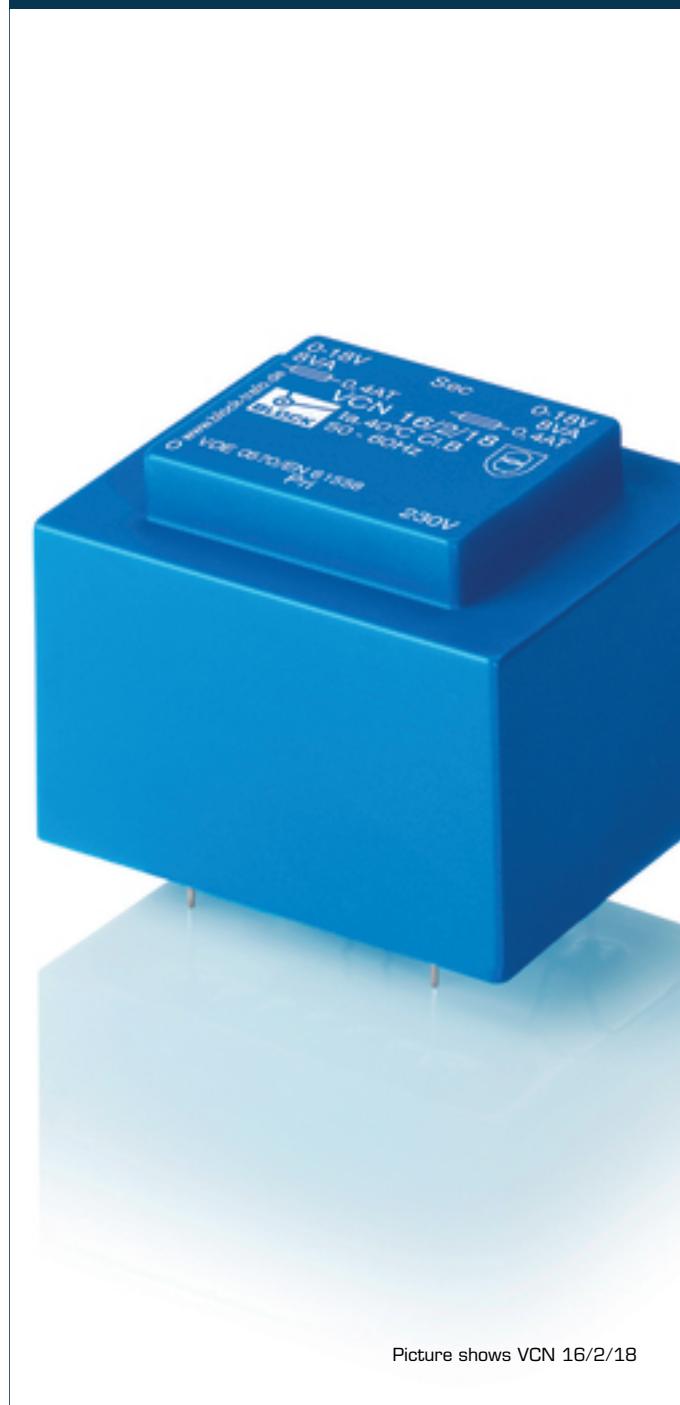
Picture shows VCN 16/2/18