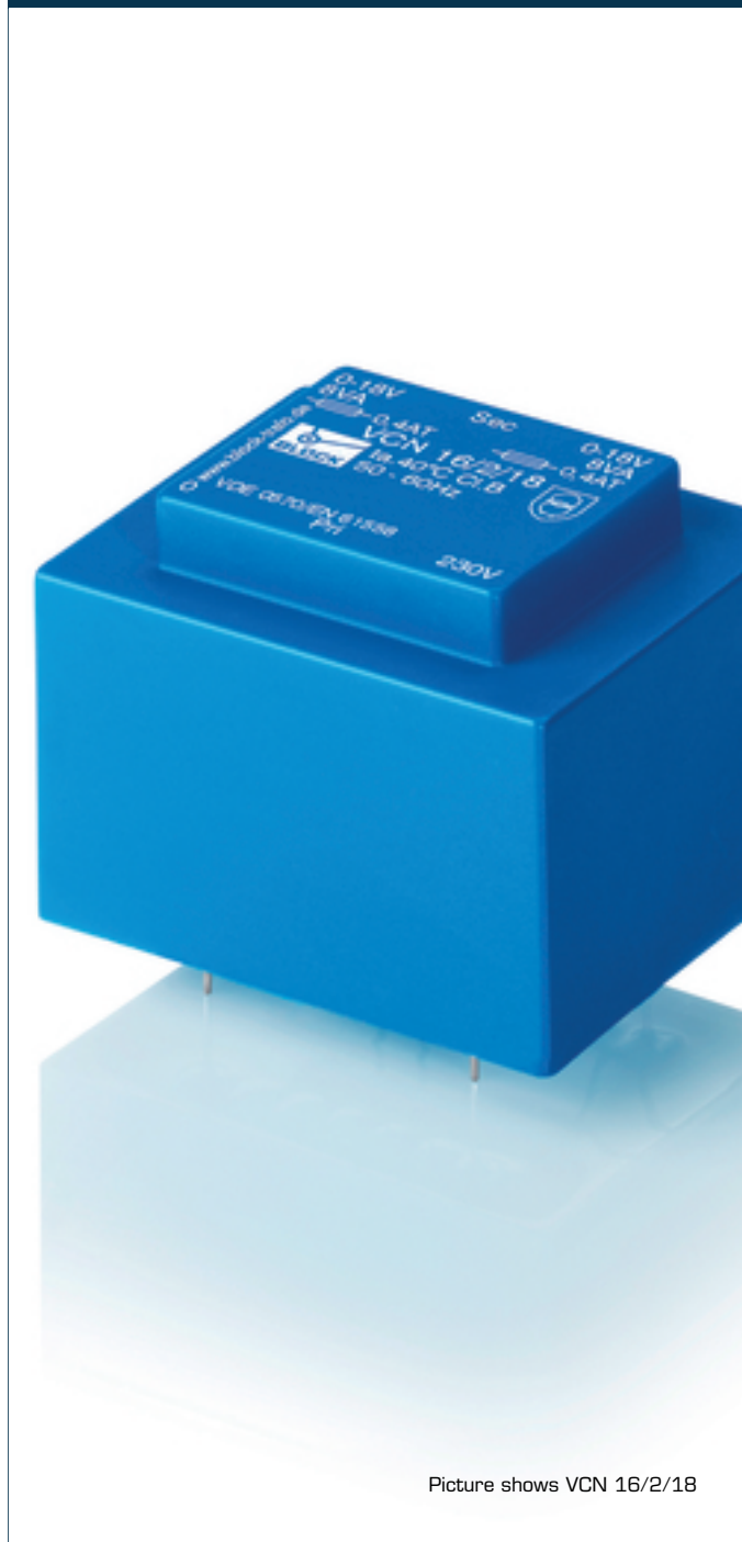
Picture shows VCN 16/2/18