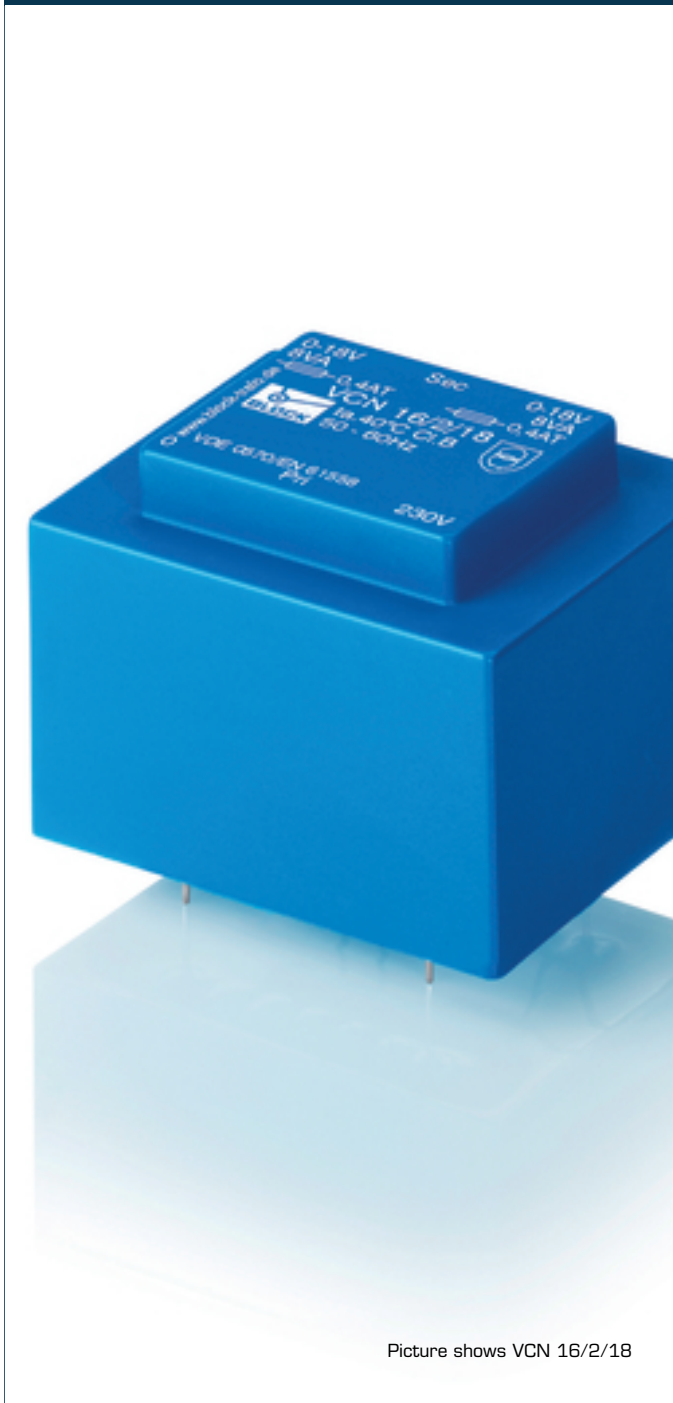
Picture shows VCN 16/2/18