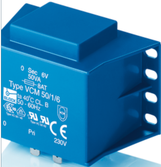
Picture shows VCM 50/1/6