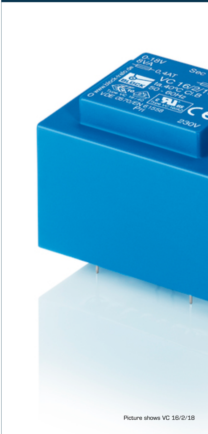
Picture shows VC 16/2/18