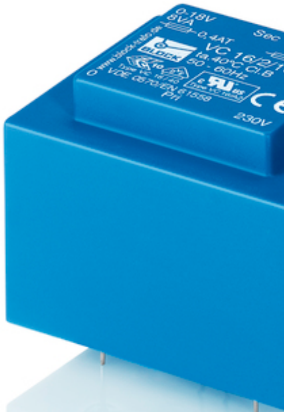
Picture shows VC 16/2/18