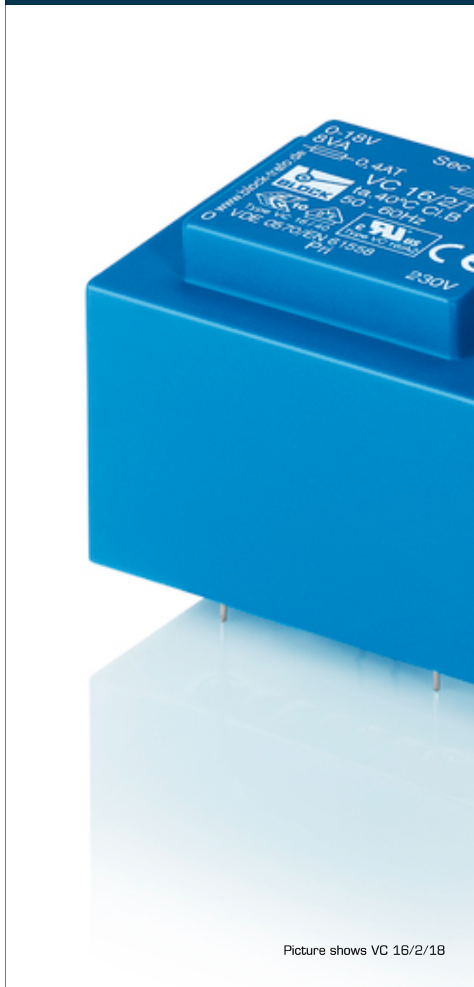
Picture shows VC 16/2/18