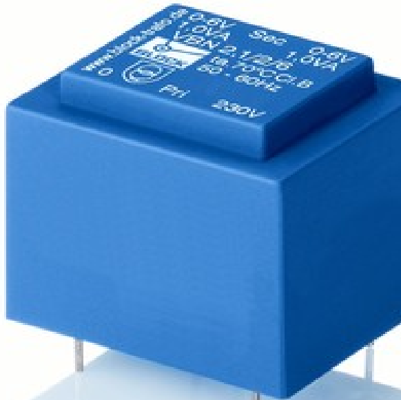
Picture shows VBN 2,1/2/6