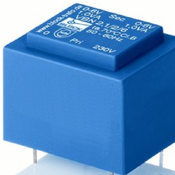
Picture shows VBN 2,1/2/6