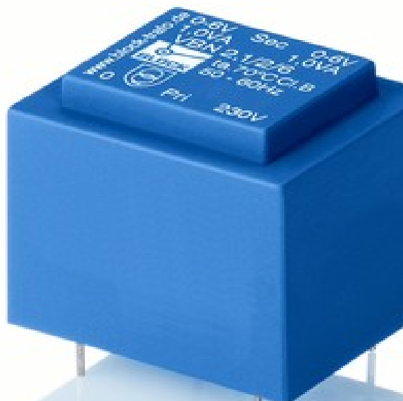
Picture shows VBN 2,1/2/6