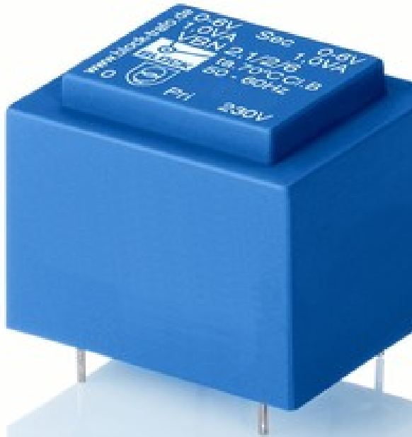
Picture shows VBN 2,1/2/6