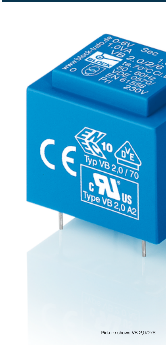
Picture shows VB 2,0/2/6