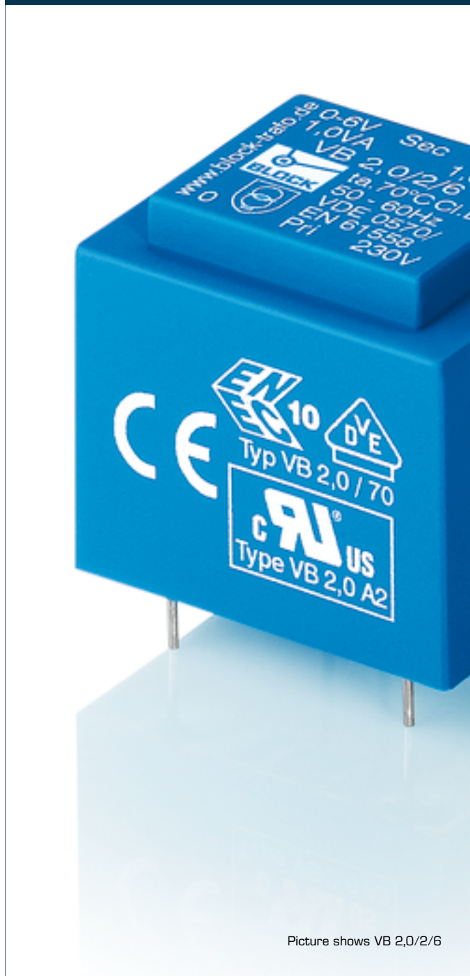
Picture shows VB 2,0/2/6