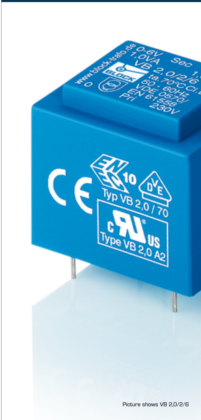
Picture shows VB 2,0/2/6