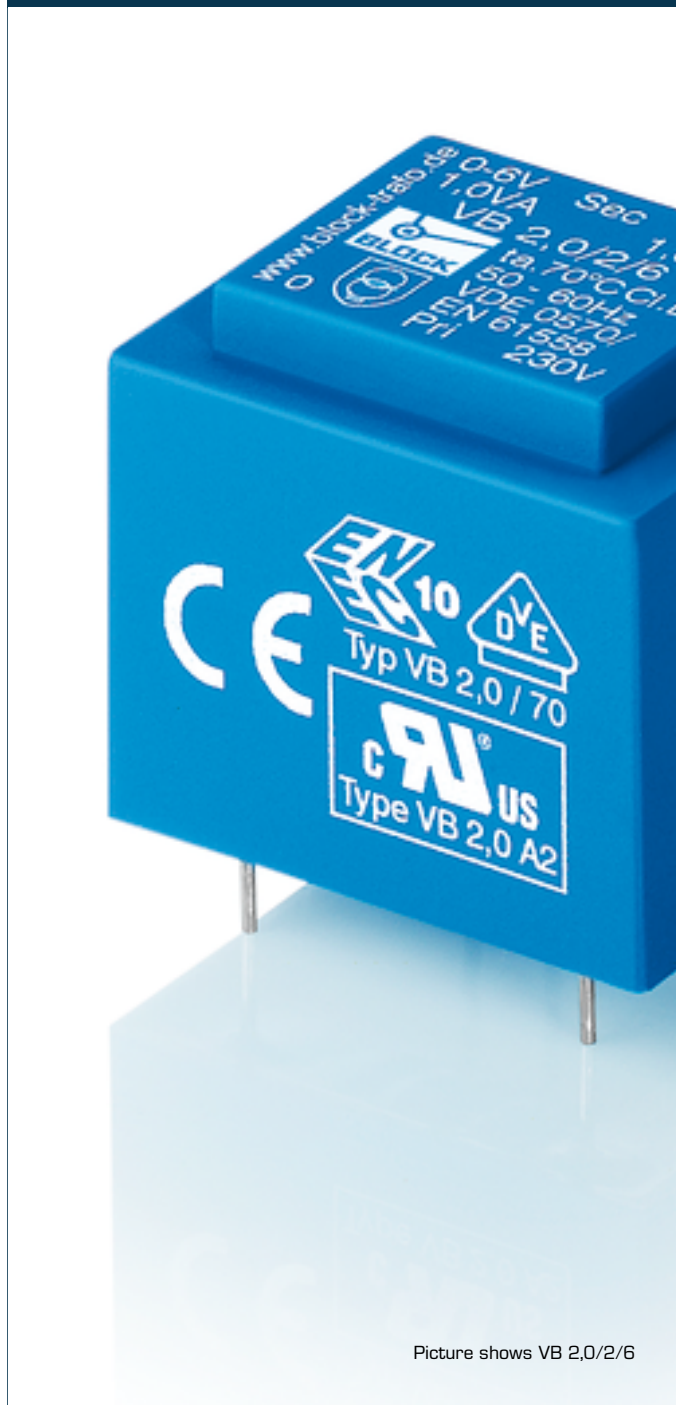
Picture shows VB 2,0/2/6