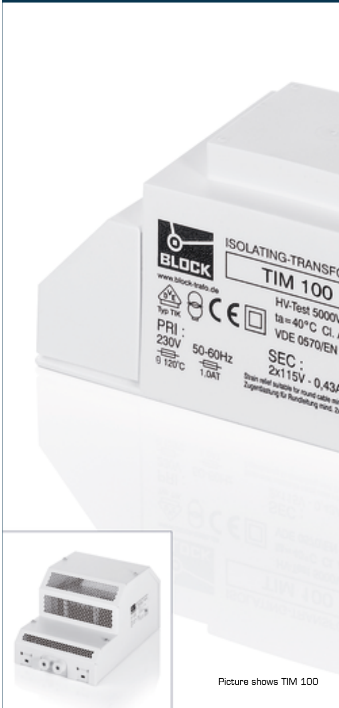
Picture shows TIM 100