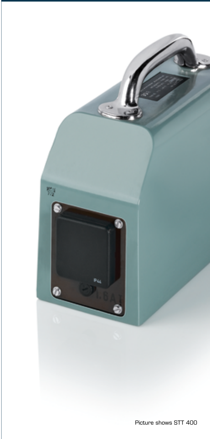
Picture shows STT 400