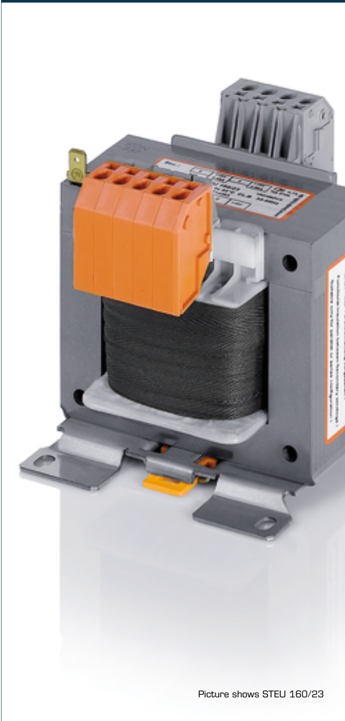
Picture shows STEU 160/23