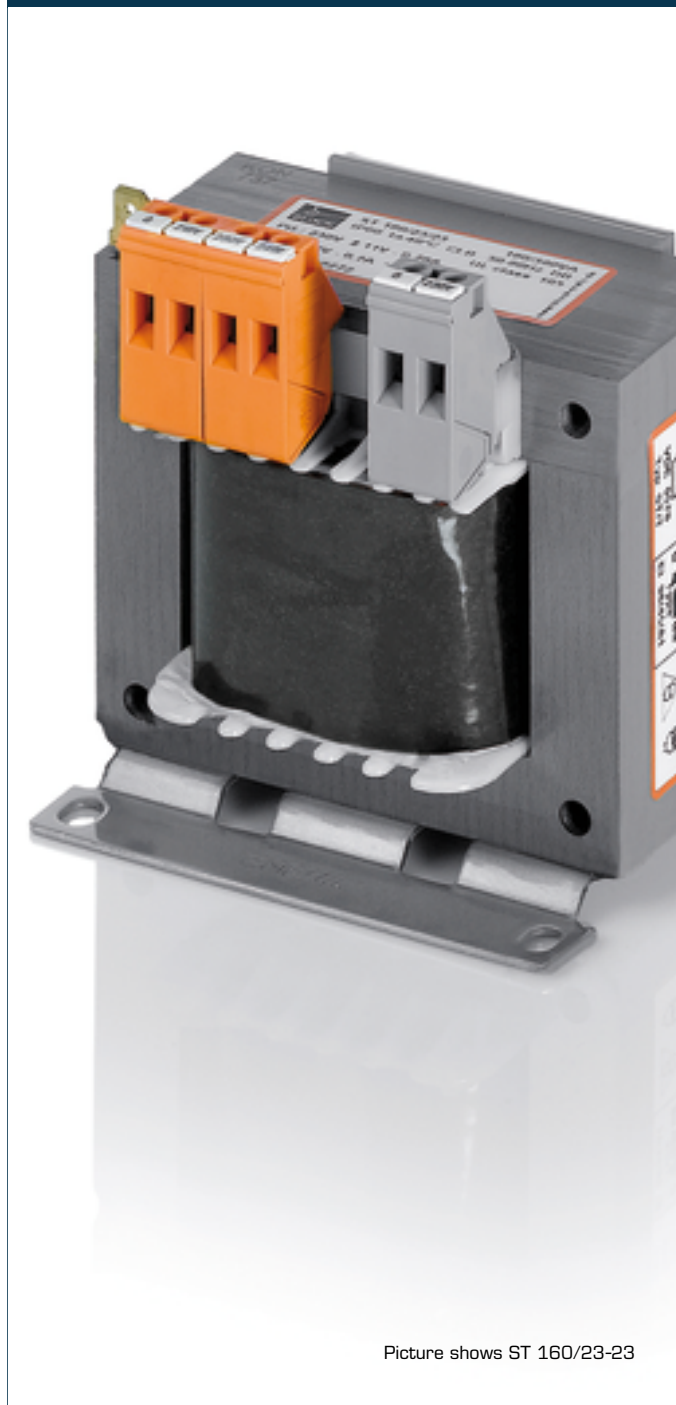
Picture shows ST 160/23-23