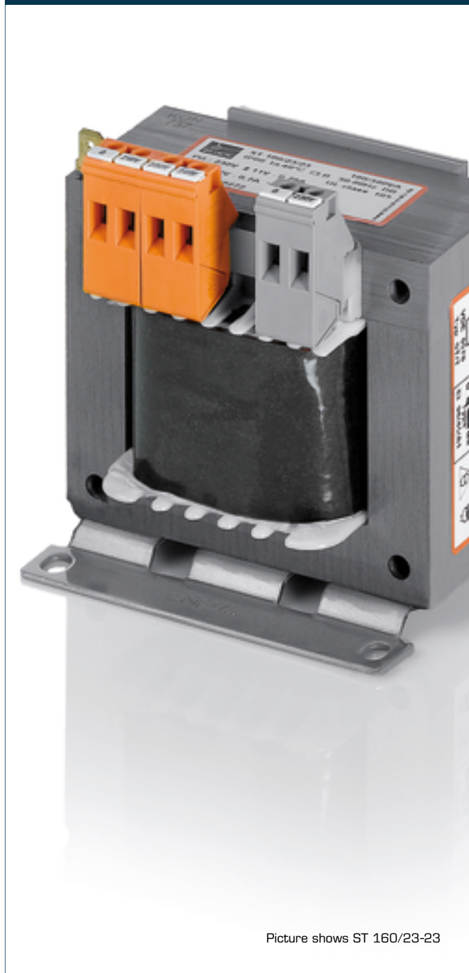
Picture shows ST 160/23-23