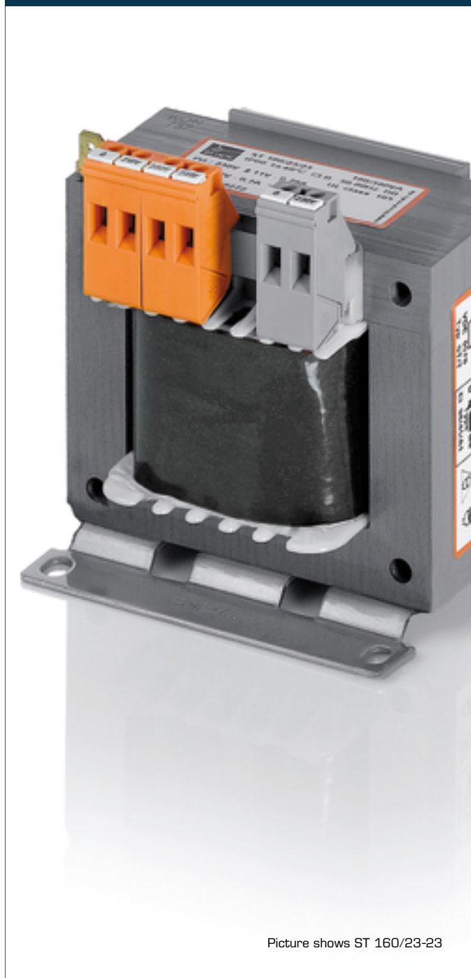
Picture shows ST 160/23-23