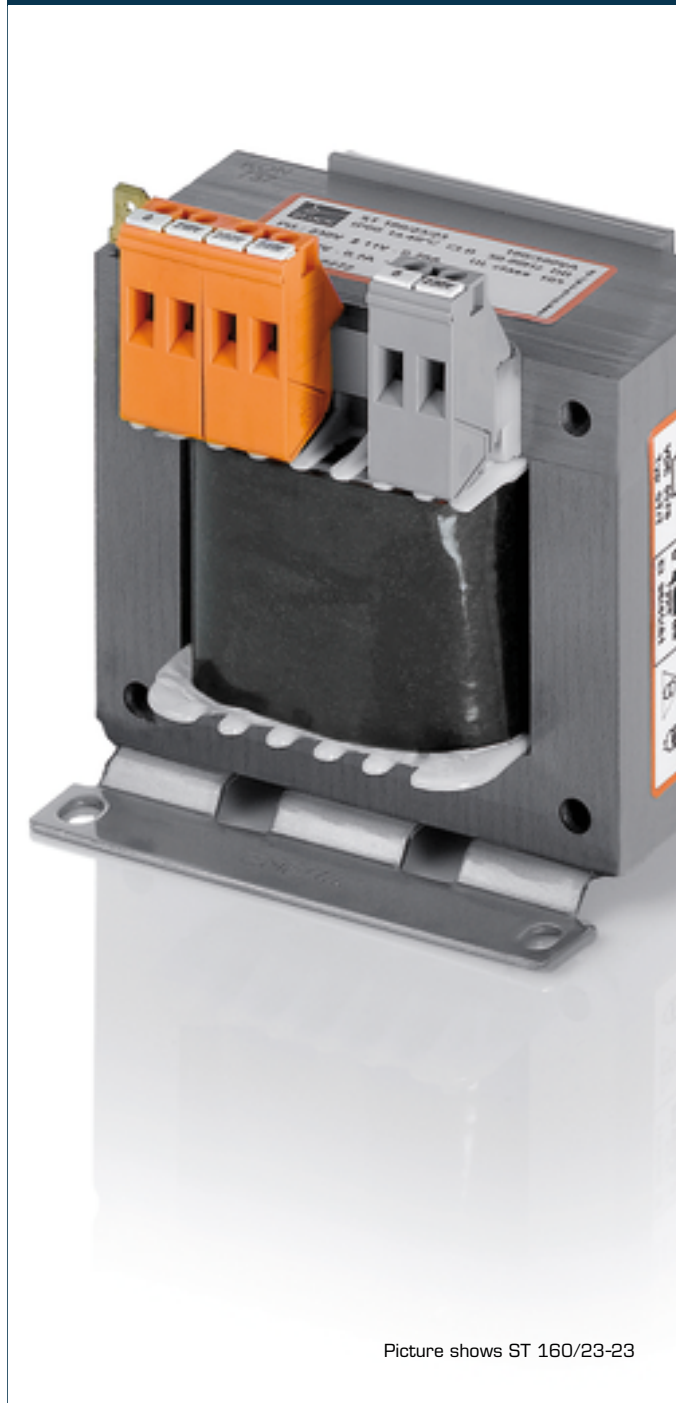
Picture shows ST 160/23-23