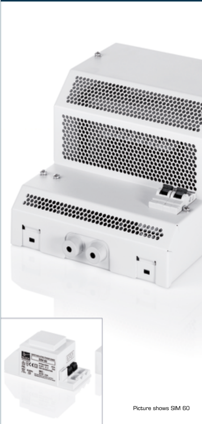
Picture shows SIM 60