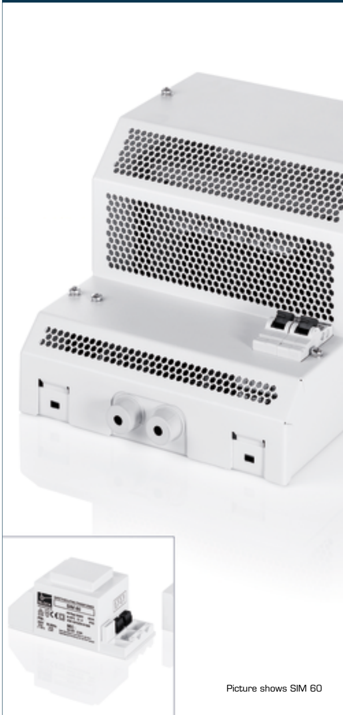
Picture shows SIM 60