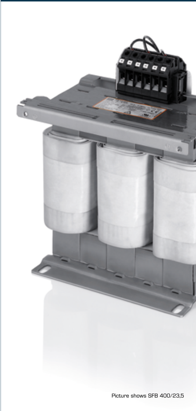
Picture shows SFB 400/23,5