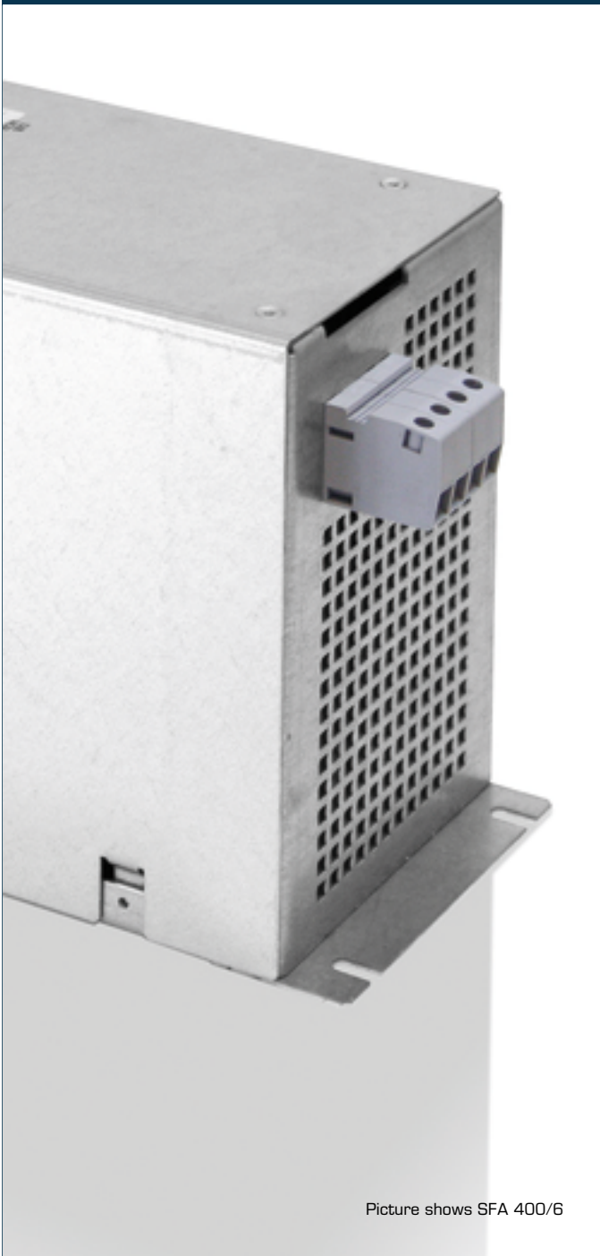
Picture shows SFA 400/6