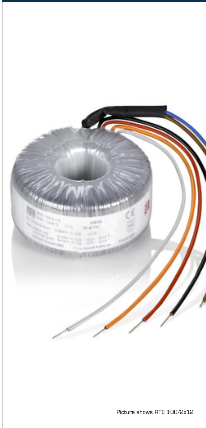
Picture shows RTE 100/2x12