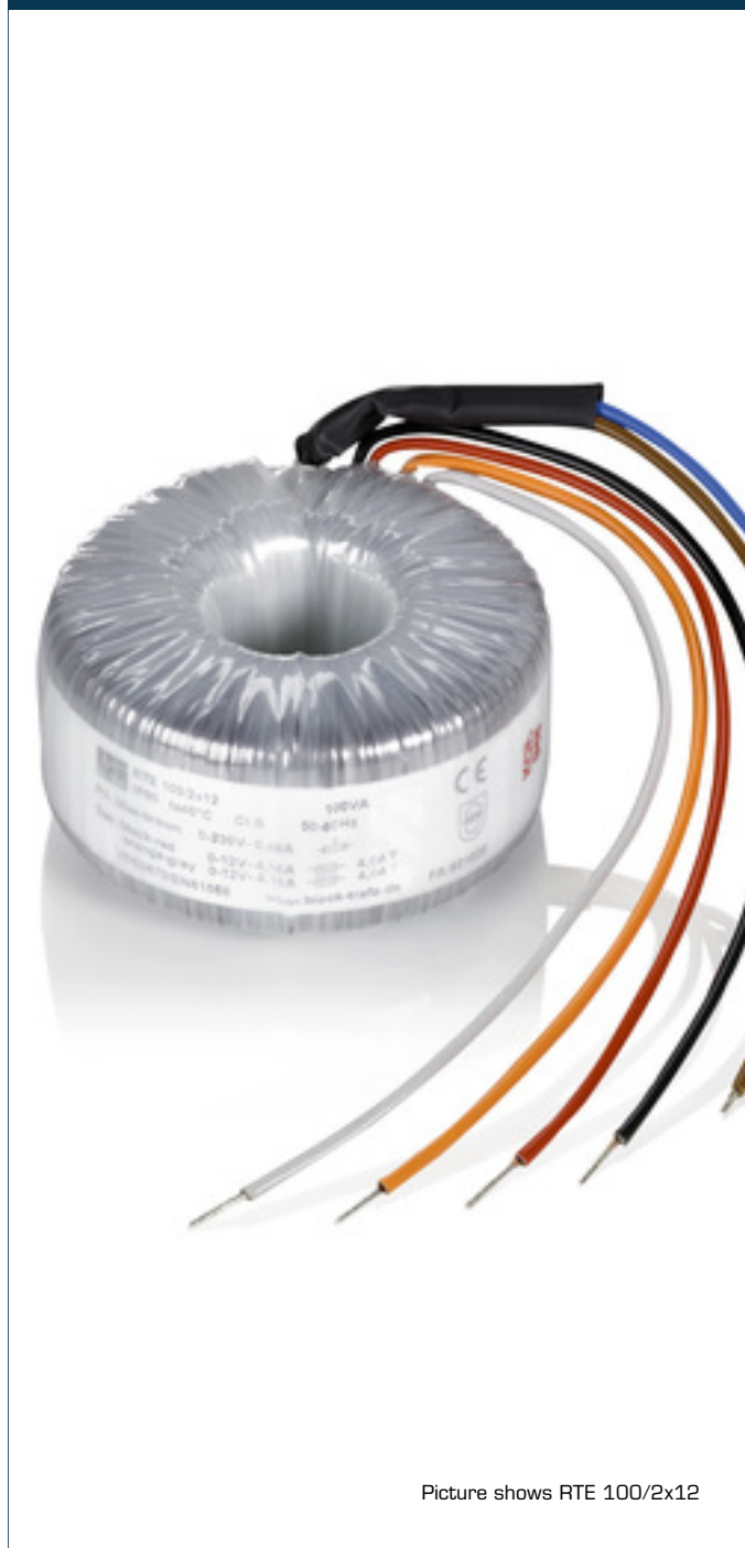
Picture shows RTE 100/2x12