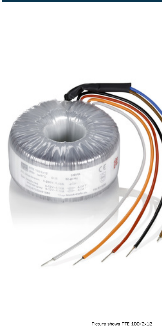
Picture shows RTE 100/2x12