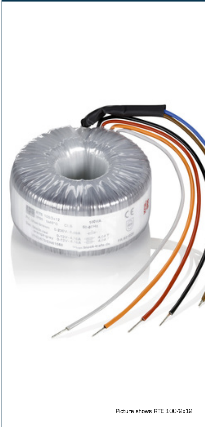
Picture shows RTE 100/2x12