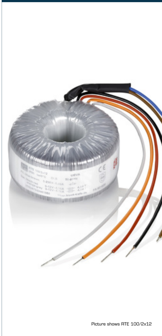
Picture shows RTE 100/2x12