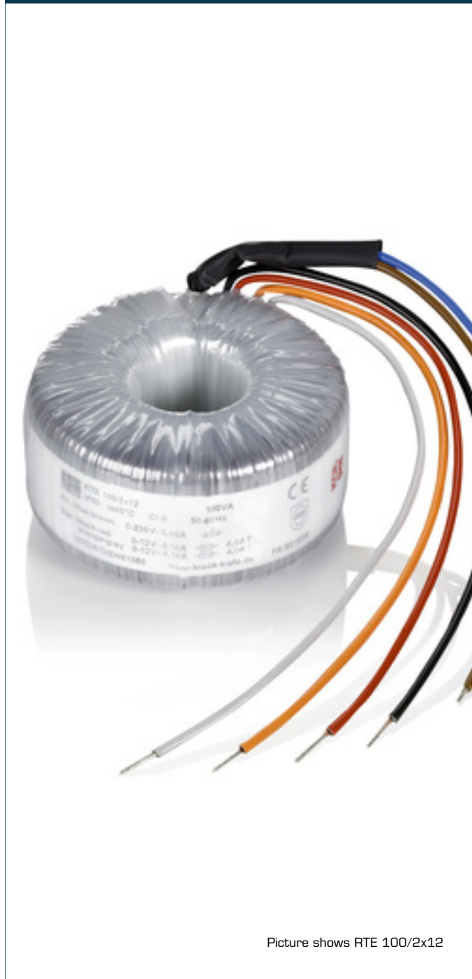
Picture shows RTE 100/2x12