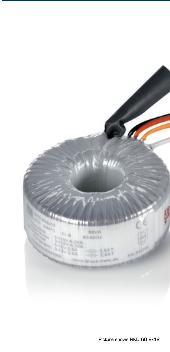
Picture shows RKD 60 2x12