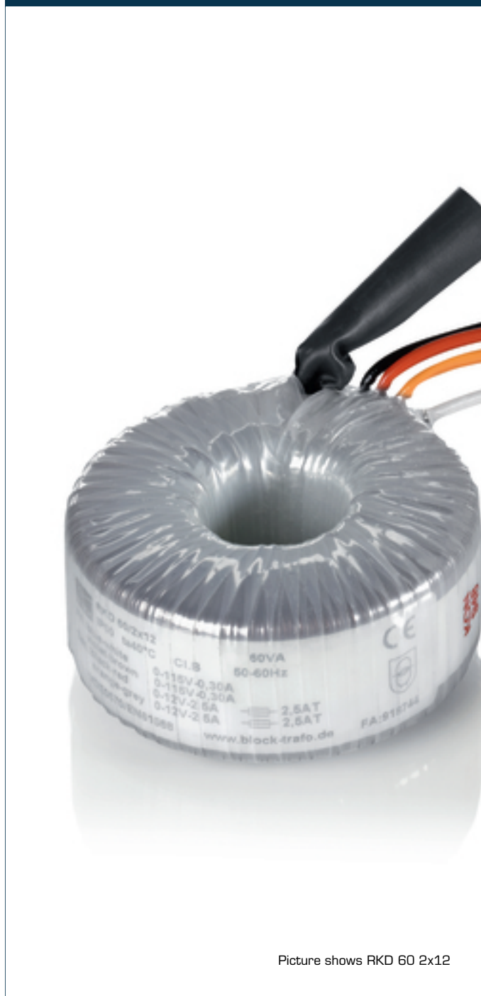
Picture shows RKD 60 2x12