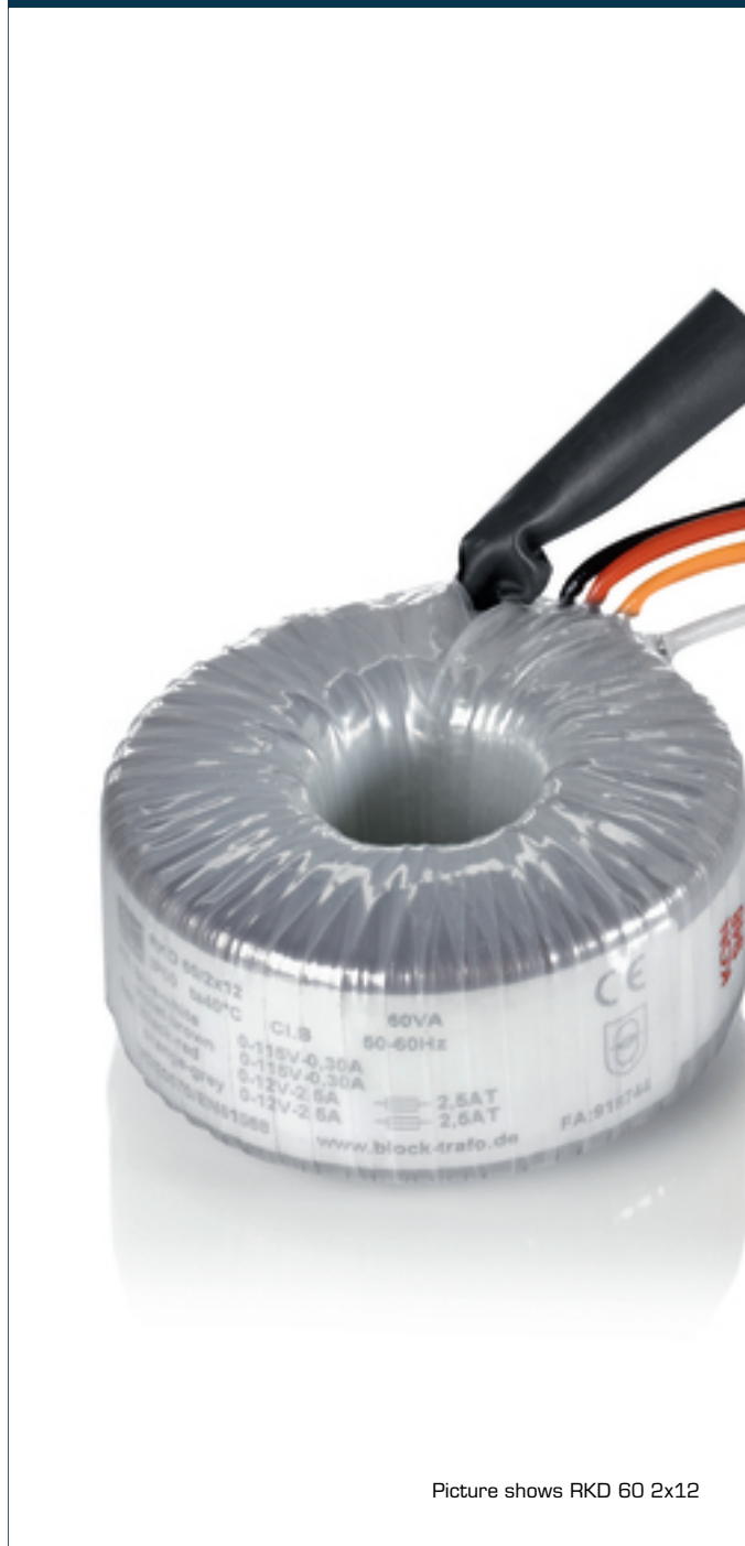
Picture shows RKD 60 2x12