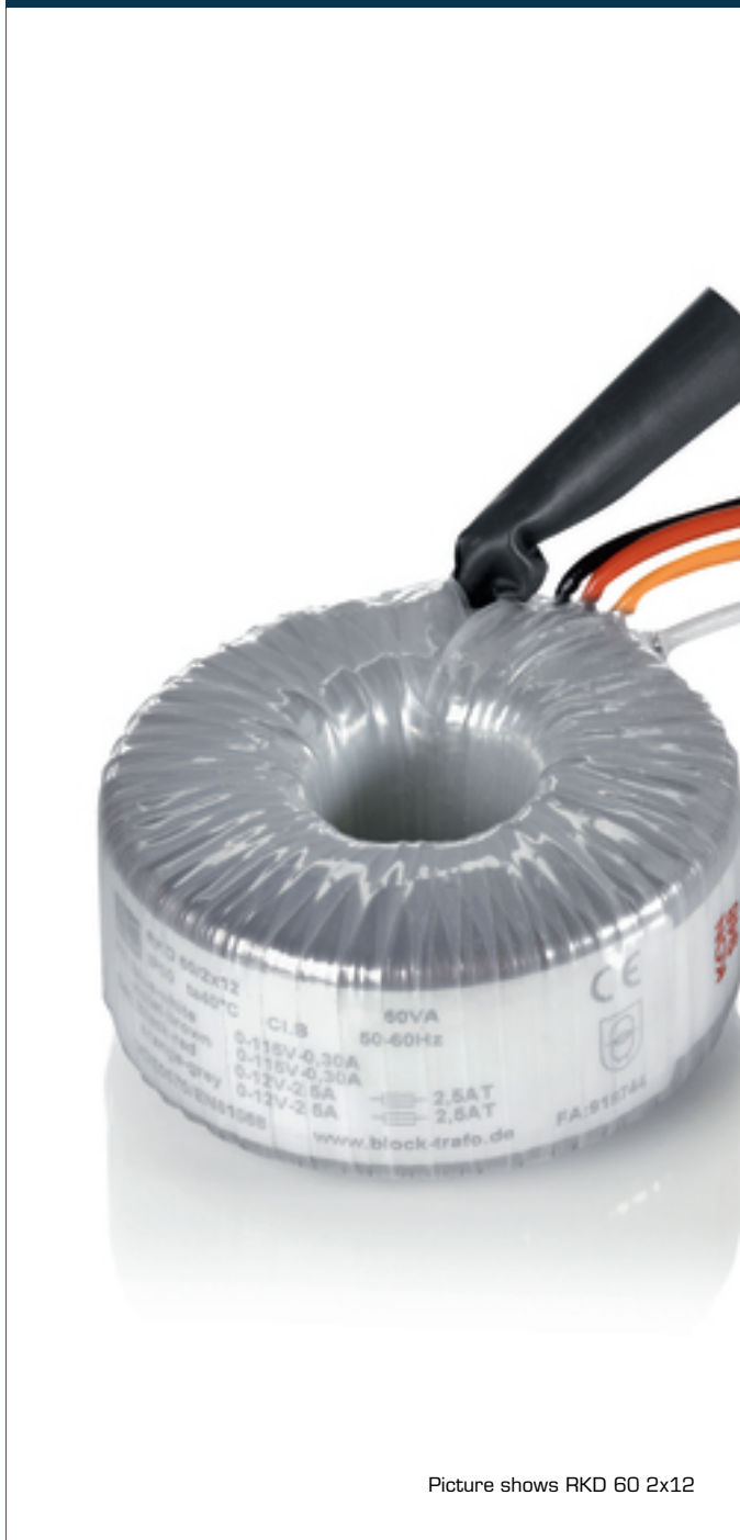
Picture shows RKD 60 2x12