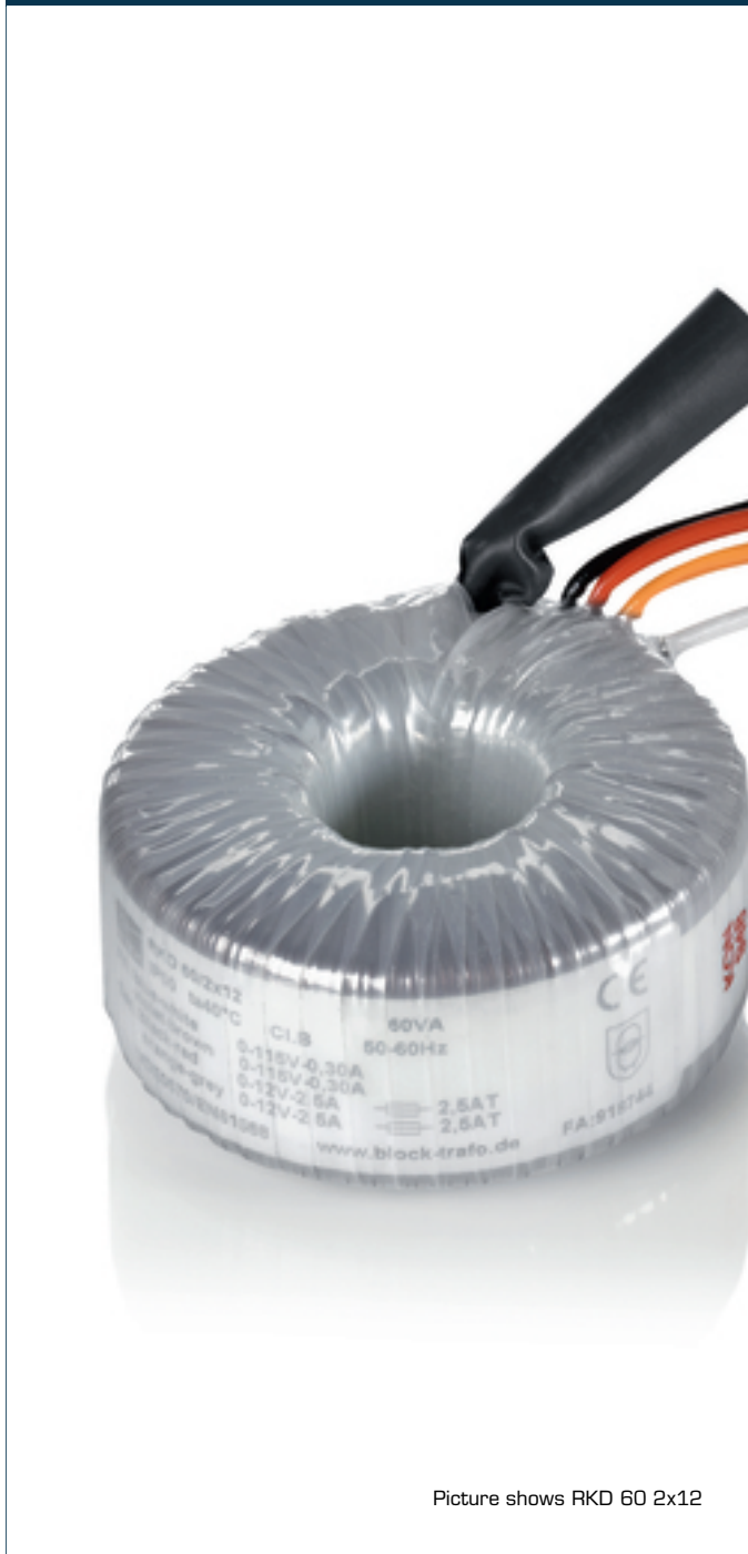
Picture shows RKD 60 2x12