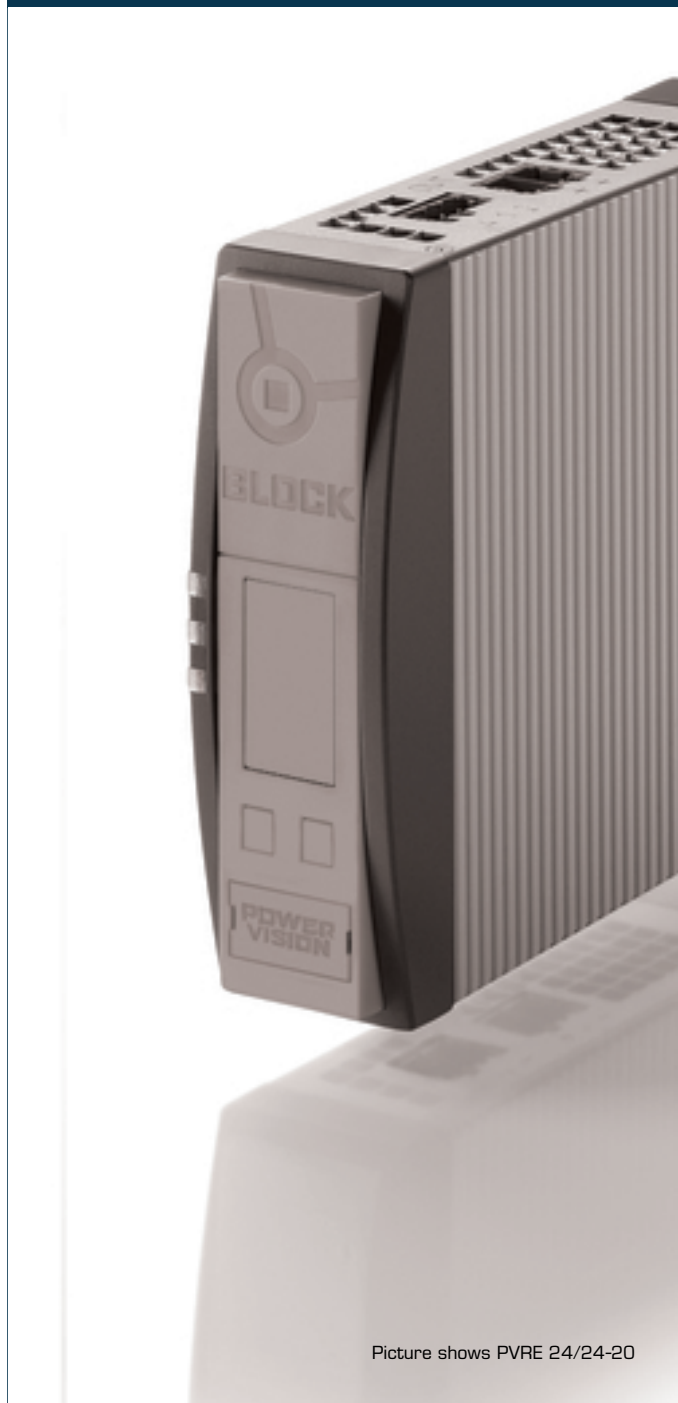
Picture shows PVRE 24/24-20