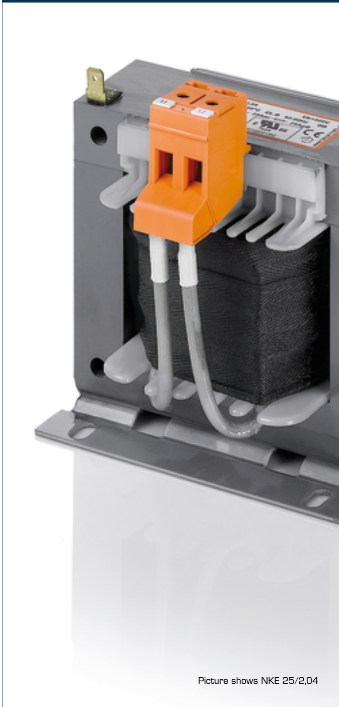
Picture shows NKE 25/2,04