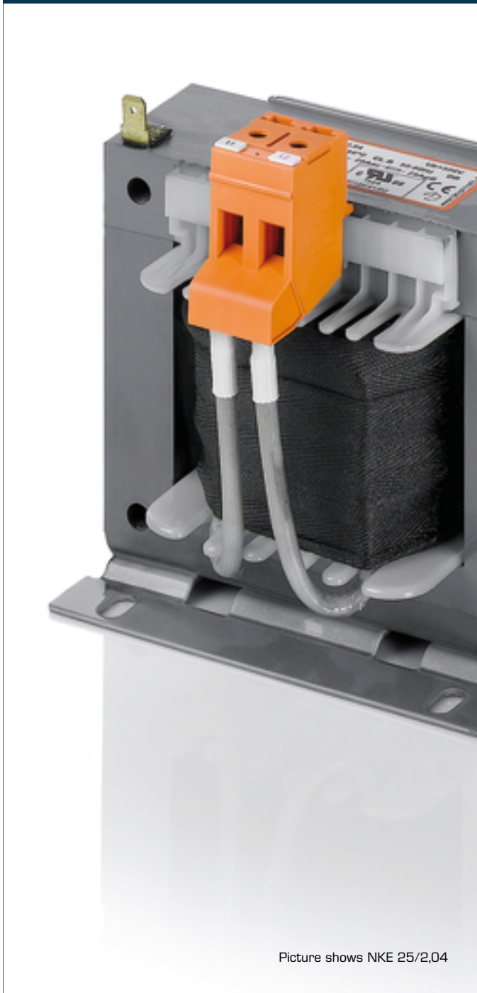
Picture shows NKE 25/2,04